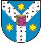
"Alexandru Ioan Cuza" University of Iași