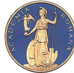
Romanian Academy Biological Sciences Section